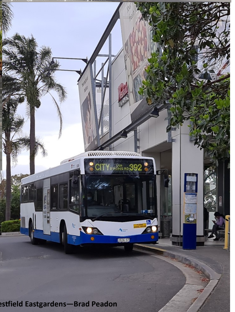
Westfield Eastgardens—Brad Peadon