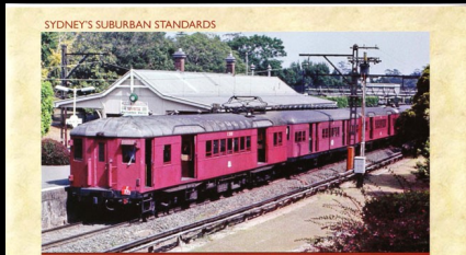
SINGLE DECKERS FROM NEWCASTLE THE CARS BUILT AT WALSH ISLAND DOCKYARD VOLUME 1 - THE POWER CARS C 3171 to 3220 Roy Howarth Glenn Ryan