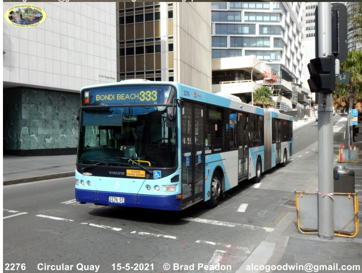
2276 Circular Quay 15-5-2021