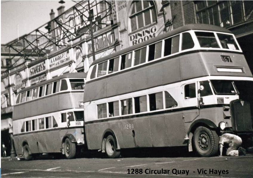
1288 Circular Quay - Vic Hayes

Given the heritage bus nature of this years fundraising, we felt it appropriate to acknowledge this important part of transport history with the following photographic collection.