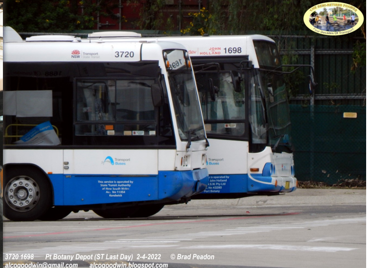
3720 1698 Pt Botany Depot (ST Last Day) 2-4-2022