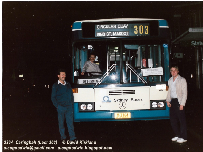
3364 Caringbah (Last 303)