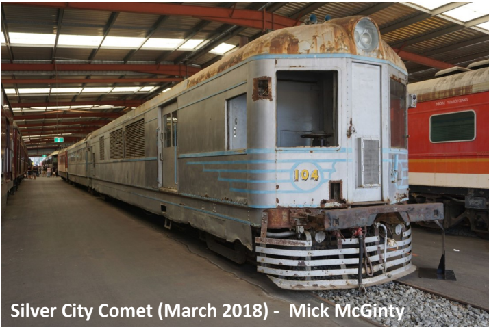
Silver City Comet (March 2018) - Mick McGinty