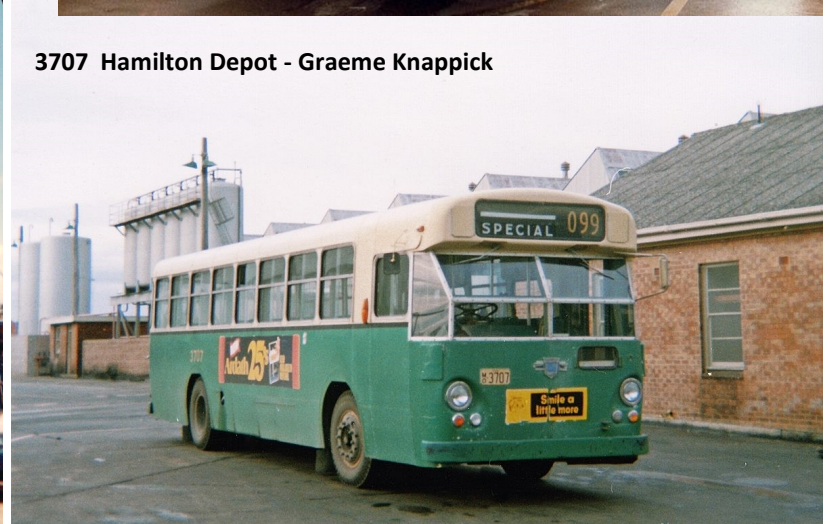
3707 Hamilton Depot - Graeme Knappick