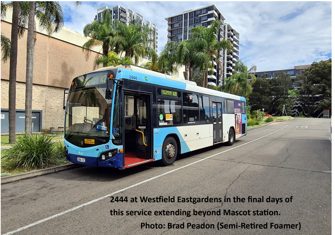
2444 at Westfield Eastgardens in the final days of this service extending beyond Mascot station.