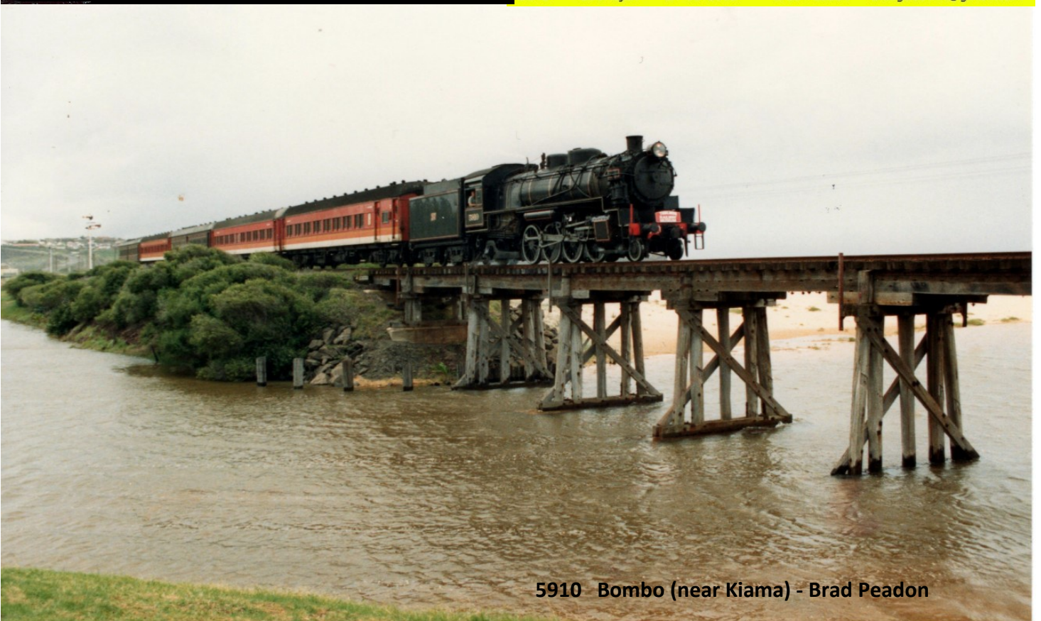
5910 Bombo (near Kiama) - Brad Peadon