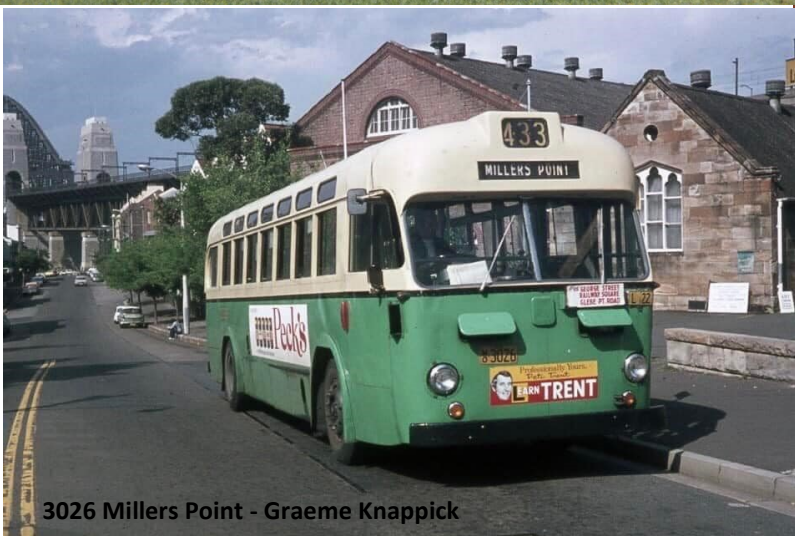
3026 Millers Point - Graeme Knappick