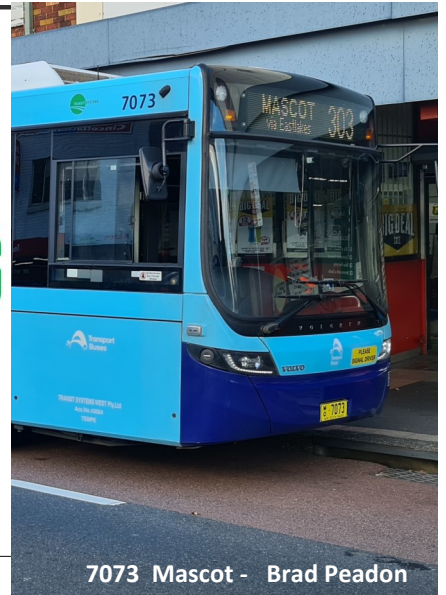
7073 Mascot - Brad Peadon