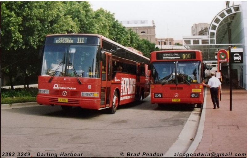
3382 3249 Darling Harbour