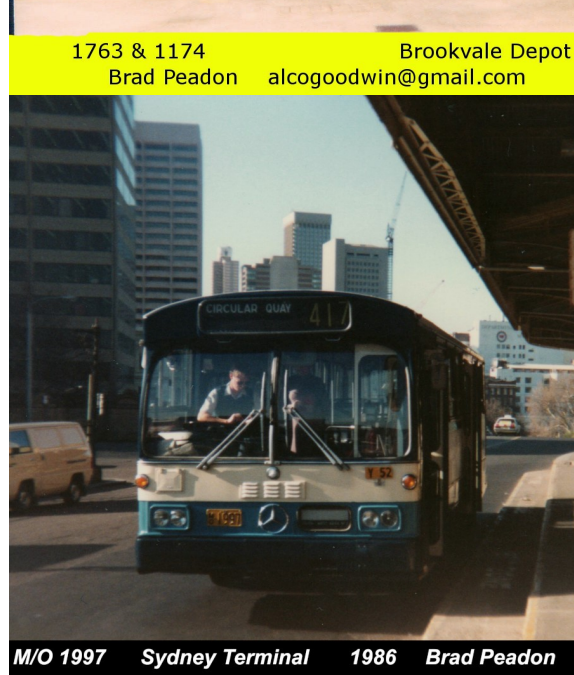
M/O 1997 Sydney Terminal 1986 Brad Peadon