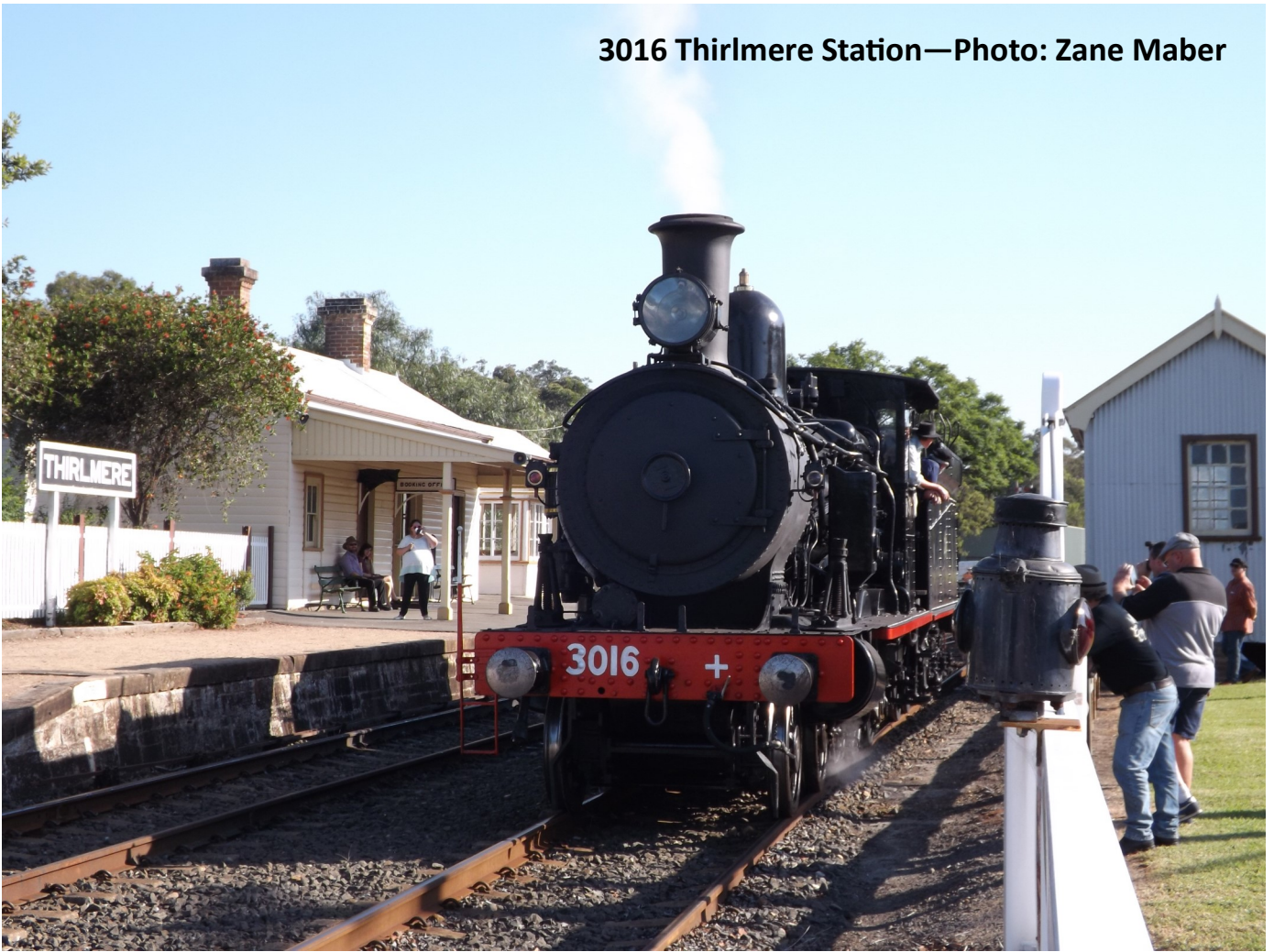
3016 Thirlmere Station