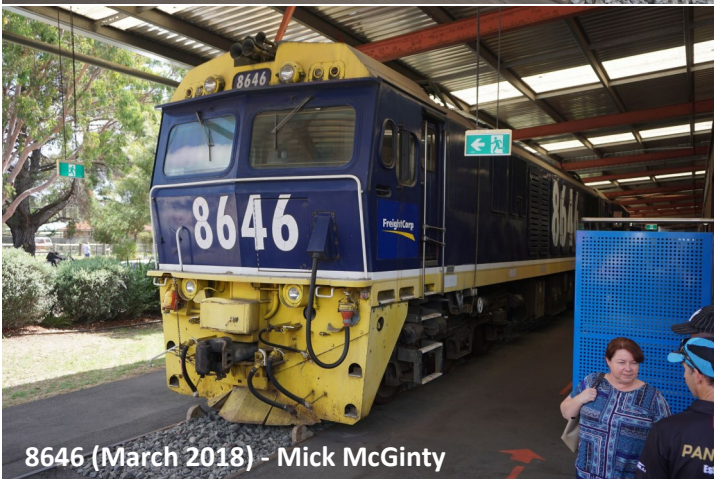
8646 (March 2018) - Mick McGinty