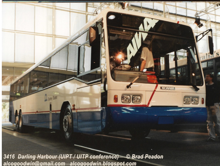
3416 Darling Harbour (UIPT / UITP conference)