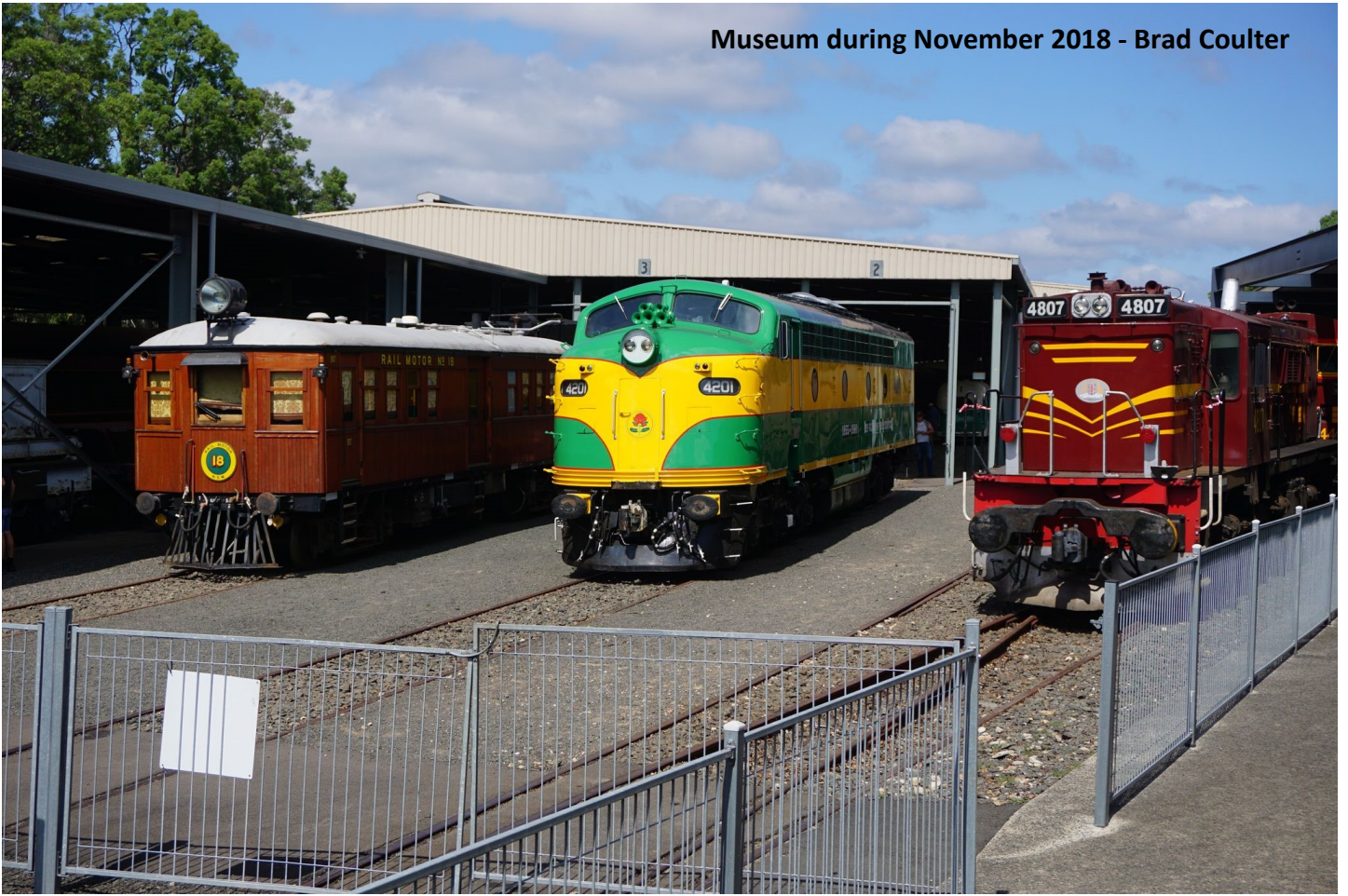
4201 4490 Thirlmere