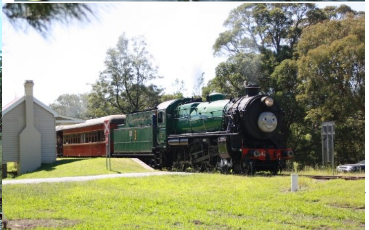
3001 Near Buxton Late 80s