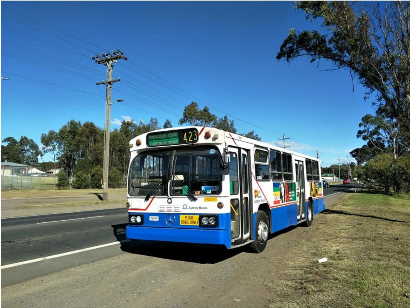
Mark 2 Mercedes - 2007

Delivered between 1978 and 1980, the NSW Government's 550 second generation Mercedes-Benz 0305 buses constituted the largest single bus order by any operator in Australia.