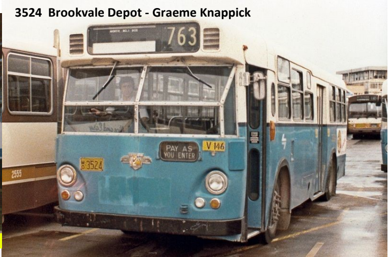
3524 Brookvale Depot - Graeme Knappick