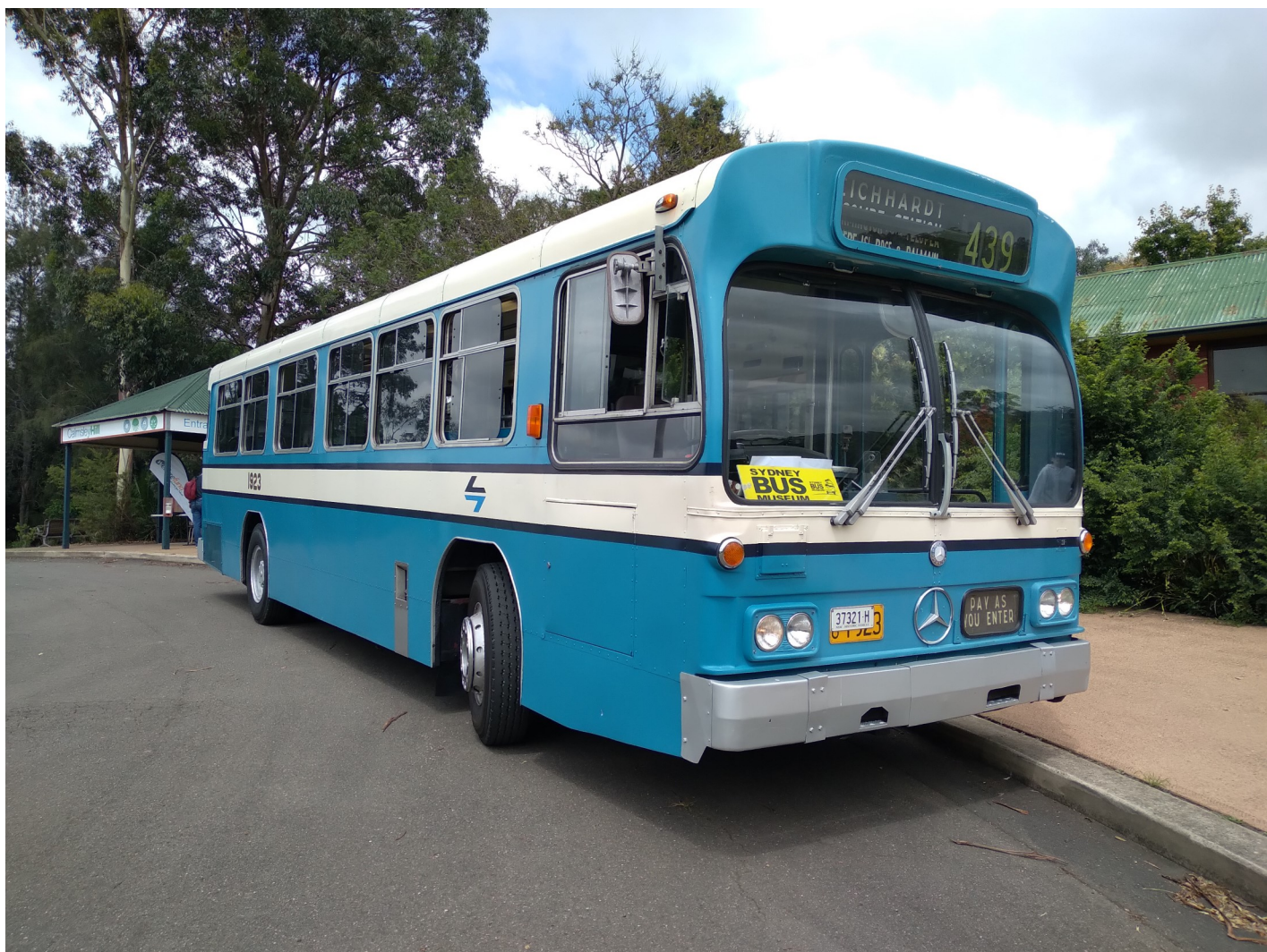
Mark 1 Mercedes - 1923

The 199 PMC-bodied Mercedes Benz 0305 'Mark 1' buses delivered during 1977 and 1978 signalled the first stage in modernising the NSW government bus fleet.