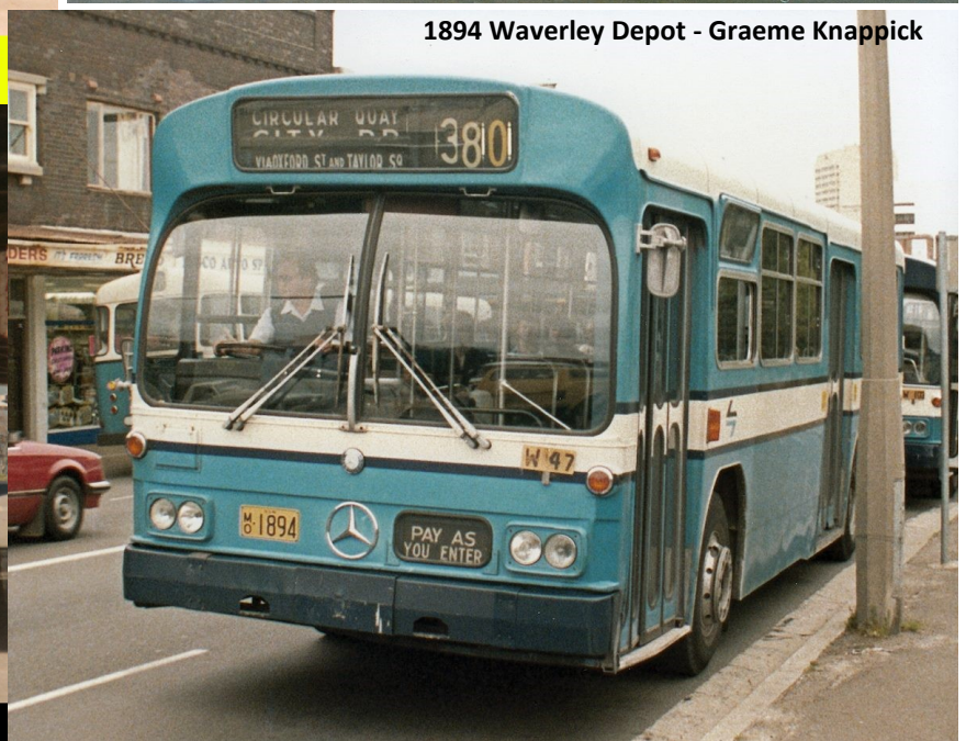
1894 Waverley Depot - Graeme Knappick