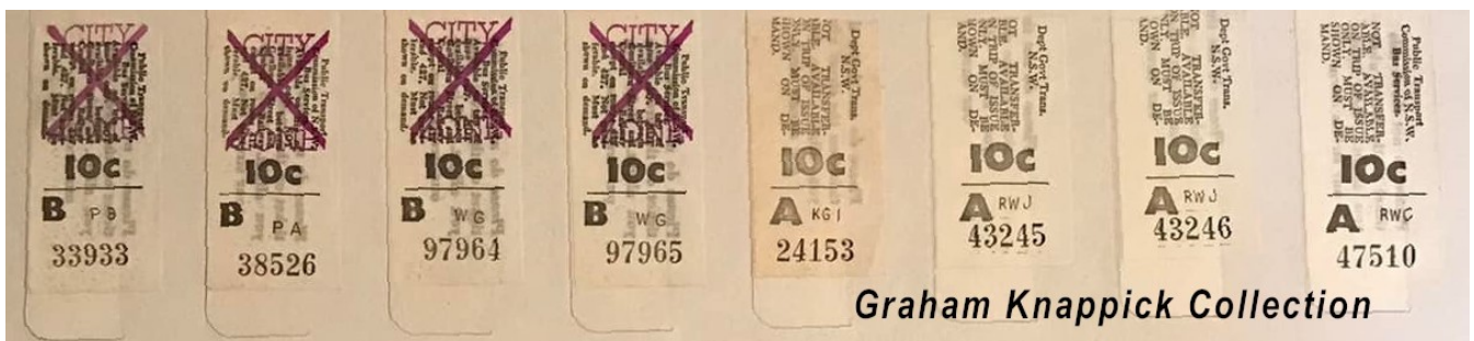
Graham Knappick Collection