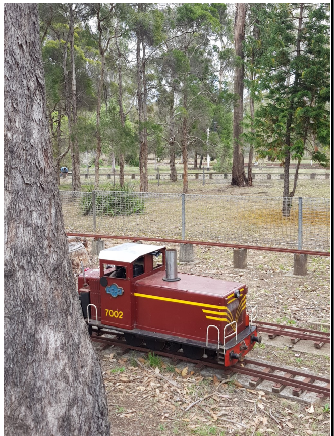
Club's First Loco.

1992 - Due to the bad condition of the track, the club commences a project aimed at giving the track a concrete base with wooden sleepers. The first section was completed this year, with the following six years seeing the whole mainline ultimately done.